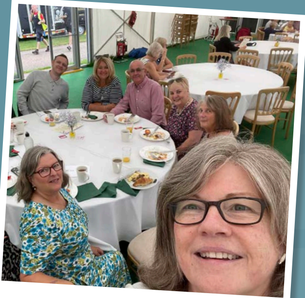
Flower Show Business Breakfast