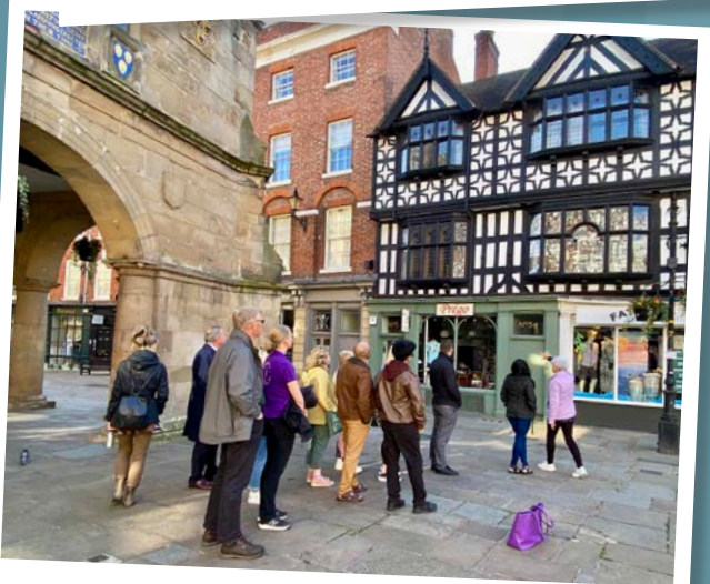
History Tour & Picnic

We love welcoming your lovely faces to our monthly events, and this year we've got some great ones lined up.